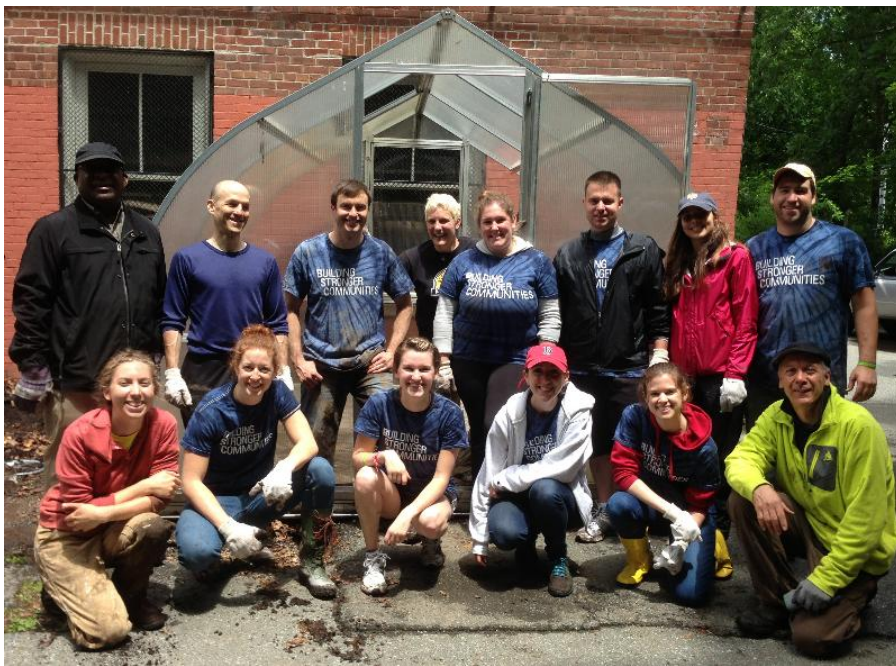
Staff members from Boston Scientific help revitalize the Manning Schoolyard last Friday.