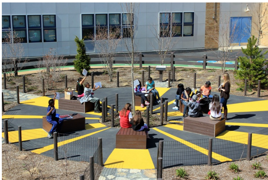
The new schoolyard at the Henry Grew Elementary School.